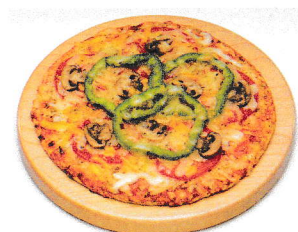
Pizza Palace £3.50