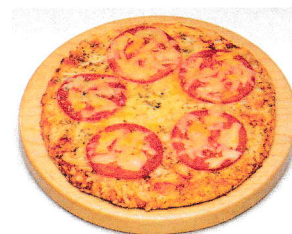
Pizza Italiano £5